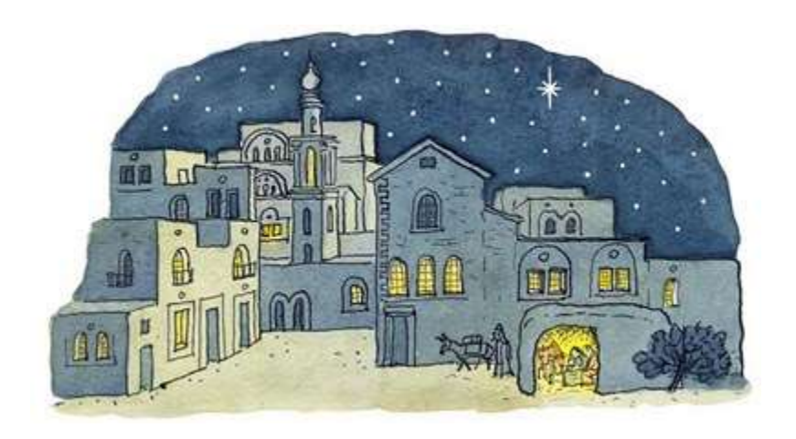
Part 1: WHERE DID IT BEGIN?

4. (Congregation)O holy Child of Bethlehem, Descend to us, we pray; Cast out our sin And enter in; Be born in us today. We hear the Christmas angels The great glad tidings tell; Oh, come to us, Abide with us, Our Lord Immanuel!